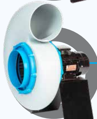
SEAT 30 Air flow rate: 700-4500 m 3 /h