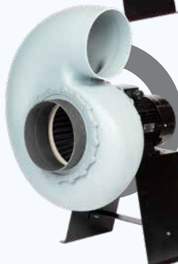
SEAT 35 Air flow rate: 1800-9000 m 3 /h