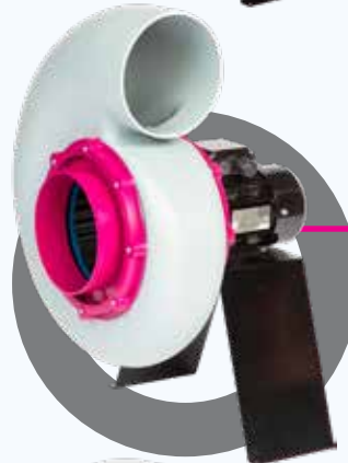
SEAT 25 Air flow rate: 500-3000 m 3 /h