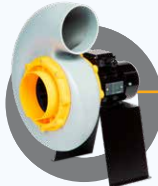
SEAT 20 Air flow rate: 200-700 m 3 /h